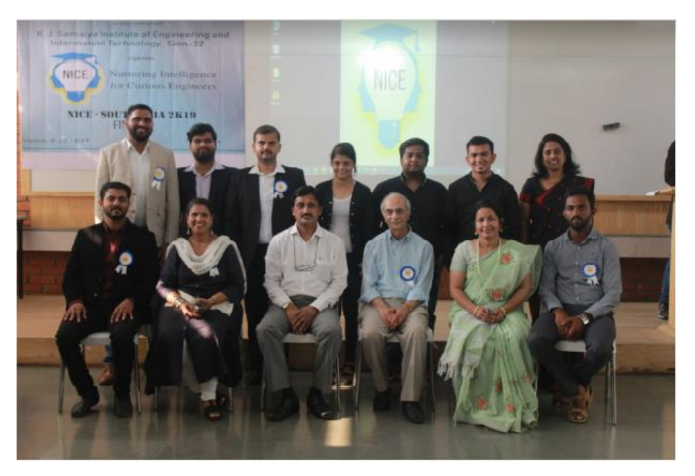
IET YP Team, Mumbai LN & Faculty Coordinators

> Teams Participated: 07 from different regions of South Asia including Sri Lanka, Kanyakumari, Goa, Mumbai, Nashik, Pune & Dhule