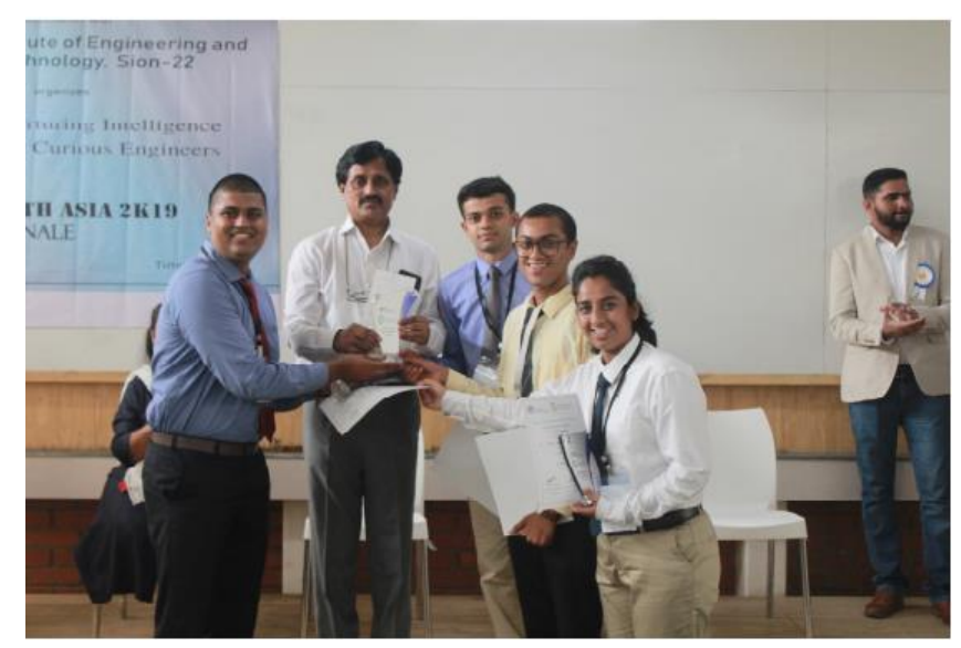
The Winner Team from SSVPS BSD College of Engineering, Dhule

> Teams Participated: 07 from different regions of South Asia including Sri Lanka, Kanyakumari, Goa, Mumbai, Nashik, Pune & Dhule