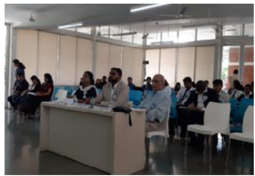
Judges of the South Asia Level Competition

➤ Teams Participated : 07 from different regions of South Asia including Sri Lanka, Kanyakumari, Goa, Mumbai, Nashik, Pune & Dhule