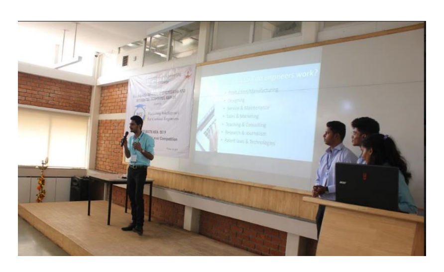
Presentation by the Teams

> Teams Participated : 08 from various Engineering Colleges of Mumbai Region