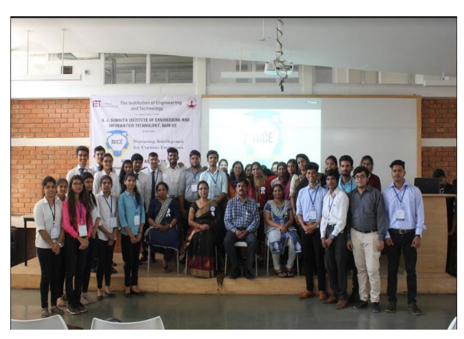
All participants of the Competition