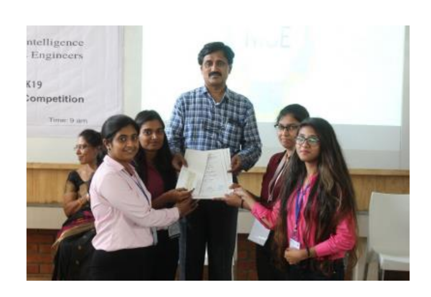
Runner up Team from KJSIEIT, Sion