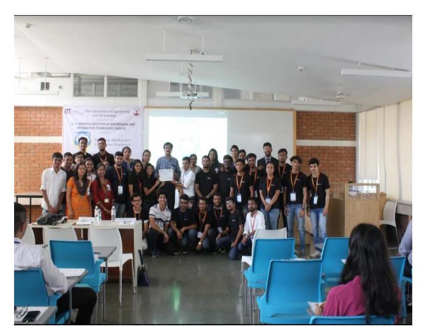
IET Volunteering Team

➤ Teams Participated : 08 from various Engineering Colleges of Mumbai Region