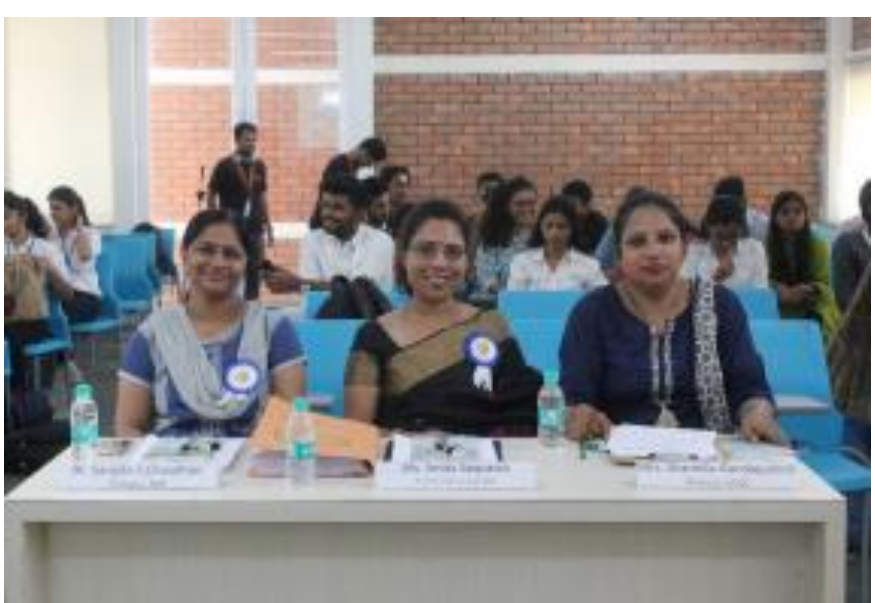
Judges of the Regional Level Competition