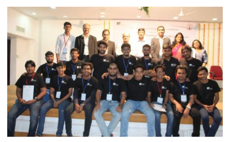
The Winner Team & Runner up team