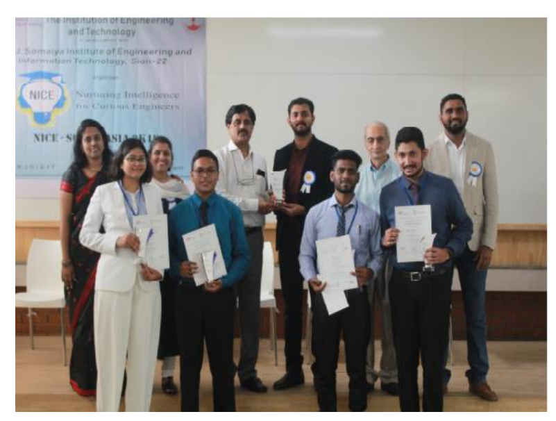
Runner up Team from AITD, Goa