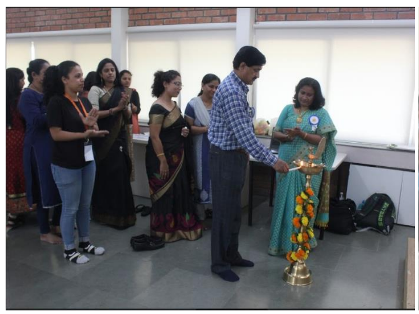
Lighting the Diya

➤ Teams Participated : 08 from various Engineering Colleges of Mumbai Region