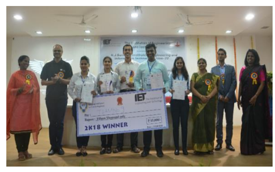
The Winner Team