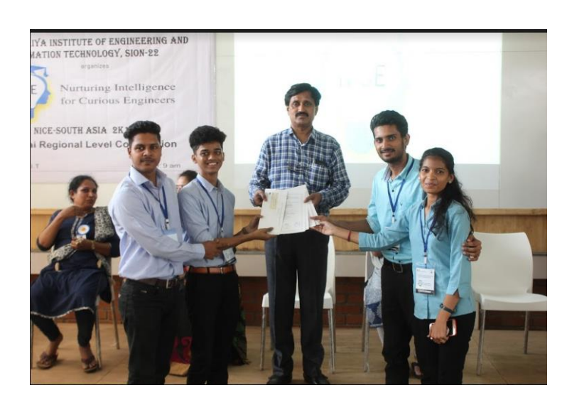
The Winner Team from Saraswati College of Engineering

➤ Teams Participated : 08 from various Engineering Colleges of Mumbai Region