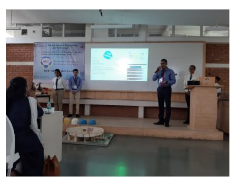
Presentation by the Teams