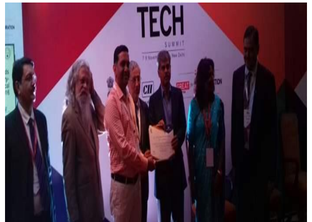
Campus Activities: (L-R) Constitution Day celebrations in campus on 25 th November ; KJSIEIT placed in Gold Category for IndPact Survey for Industry linked Tech Institutes